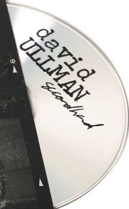
Original 2009 CD packaging